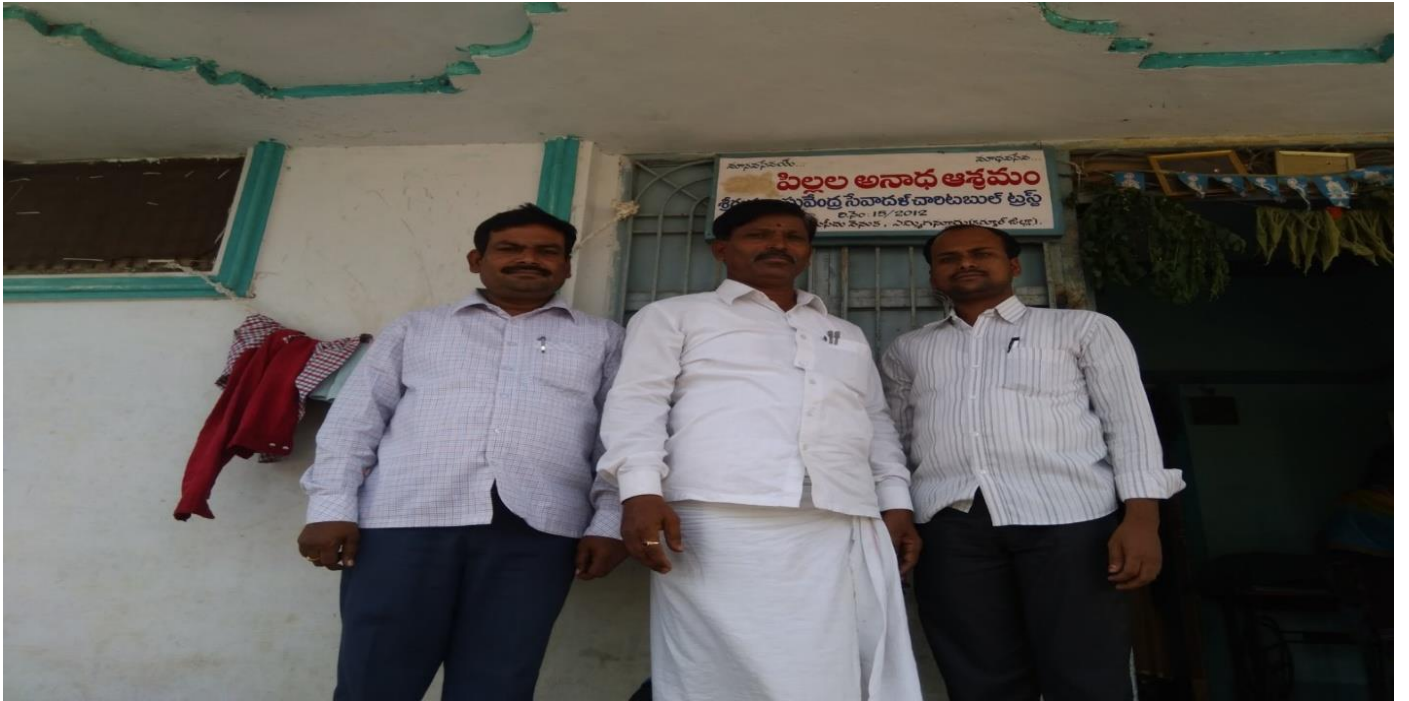
MANAGER CHILDREN ORPHANAGE