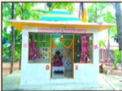
Saraswathi Temple (Inside Campus)