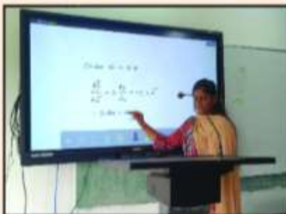
Class Seminar in Digital Class Room