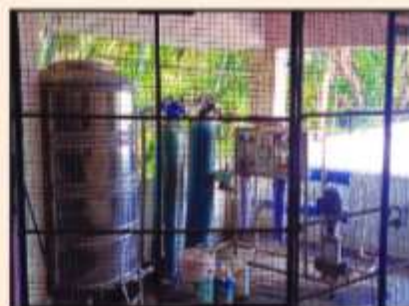
RO Water Plant Facility