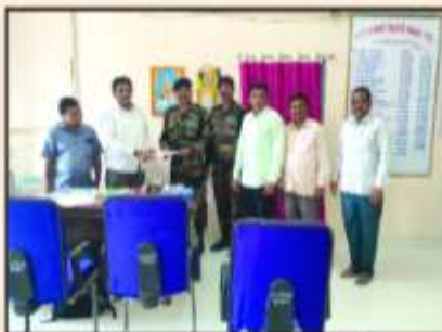
NCC Officials Visit