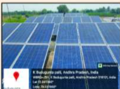
Solar Power Facility