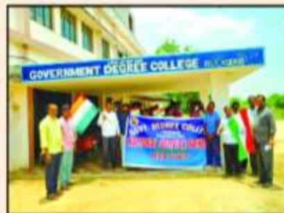
NSS Volunteers Rally