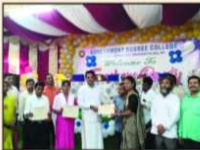
College Day Celebrations